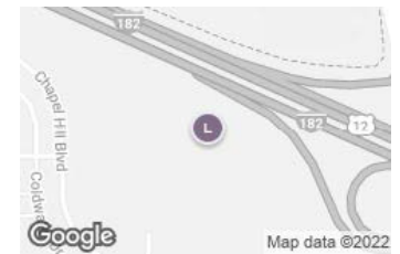
North Parcel - 117530015