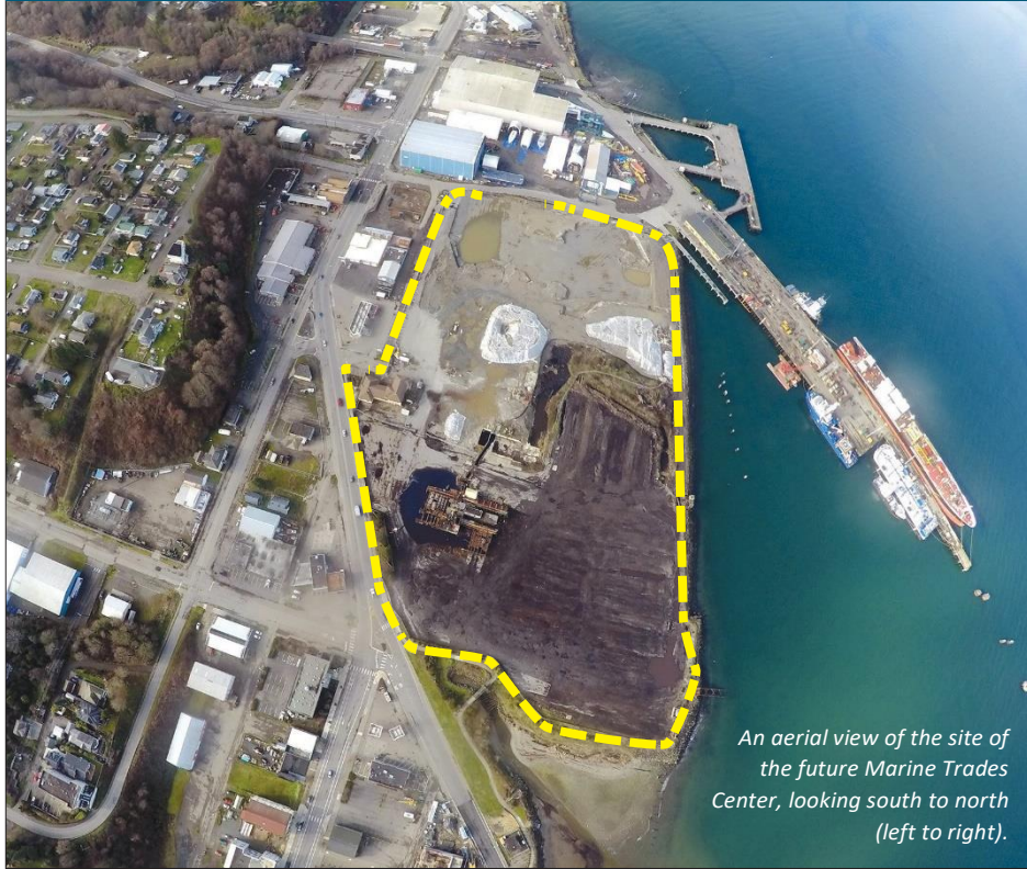
An aerial view of the site of the future Marine Trades Center, looking south to north (left to right).

This unique industrial waterfront development combines a premium location in the Pacific Northwest with the infrastructure to support a broad range of marine trades businesses.