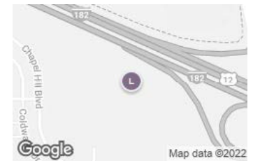
Portion of East Parcel - 117510020